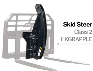
Skid Steer Class 2 HKGRAPPLE