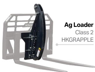
Ag Loader Class 2 HKGRAPPLE