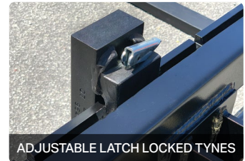
ADJUSTABLE LATCH LOCKED TYNES