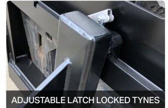
ADJUSTABLE LATCH LOCKED TYNES