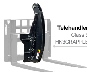
Telehandler Class 3 HK3GRAPPLE